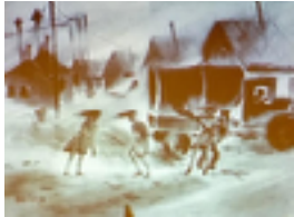
Dust storm in the Japanese Camp, by Japanese resident

Although Sally and her 11 siblings were born in the US, they were Japanese Americans. Caught up in the furor following the attack on Pearl Harbor, all Japanese Americans were suddenly suspect. Those living on the West